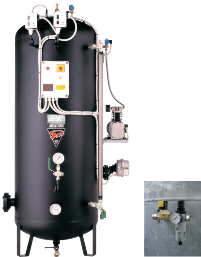
Accessories “A” Accessories “B”

Insulation in mineral wool (see page 317)